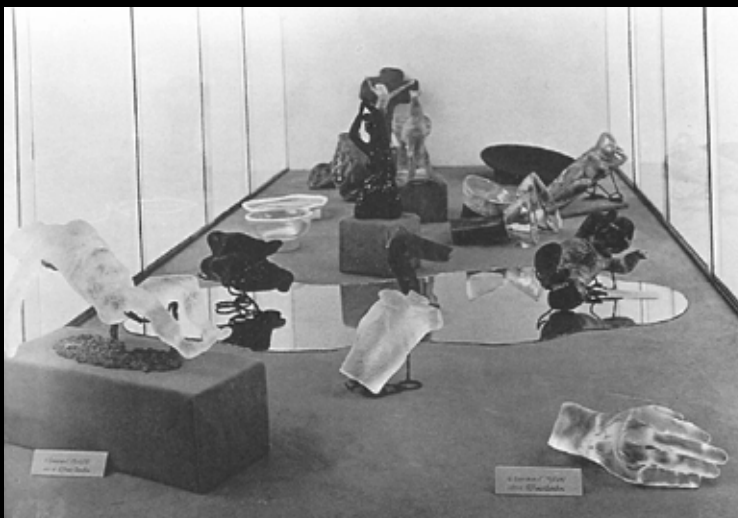
Vetreria Gino Cenedese Stand, XXIV Biennale, Venice, 1948

The following works from the private collection of Gino and Amelio Cenedese are presented at auction here for the first time.